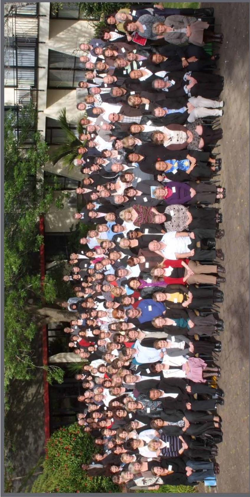
Centra Hotel Auckland 2008